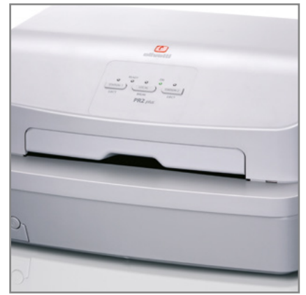
ADVANCED PAPER MANAGEMENT guarantees automatic alignment on all documents