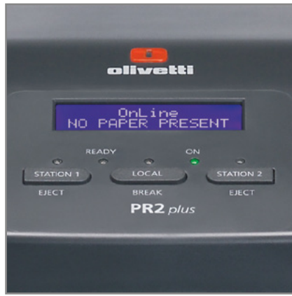
Backlit dot matrix ALPHANUMERIC DISPLAY , 2 lines x 16 characters